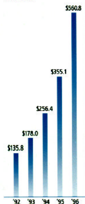
Revenues (in millions)